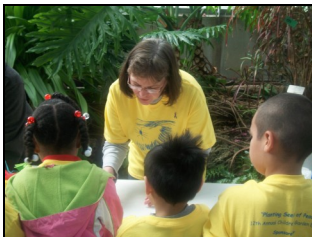
Center for Prevention of Abuse, Children's Garden