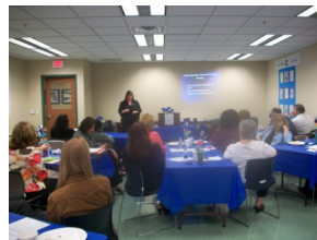
April Breakfast Launch