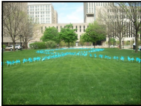
Hands Around the Courthouse